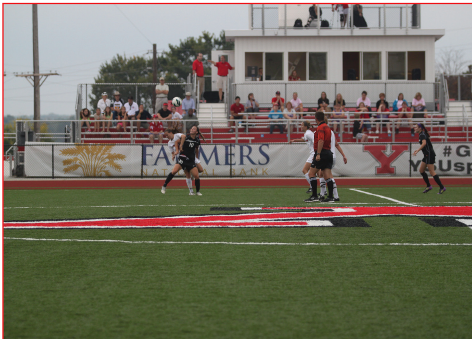
The 2013 campaign marked the inaugural season at Farmers National Bank Field, the women's soccer program's on-campus venue.